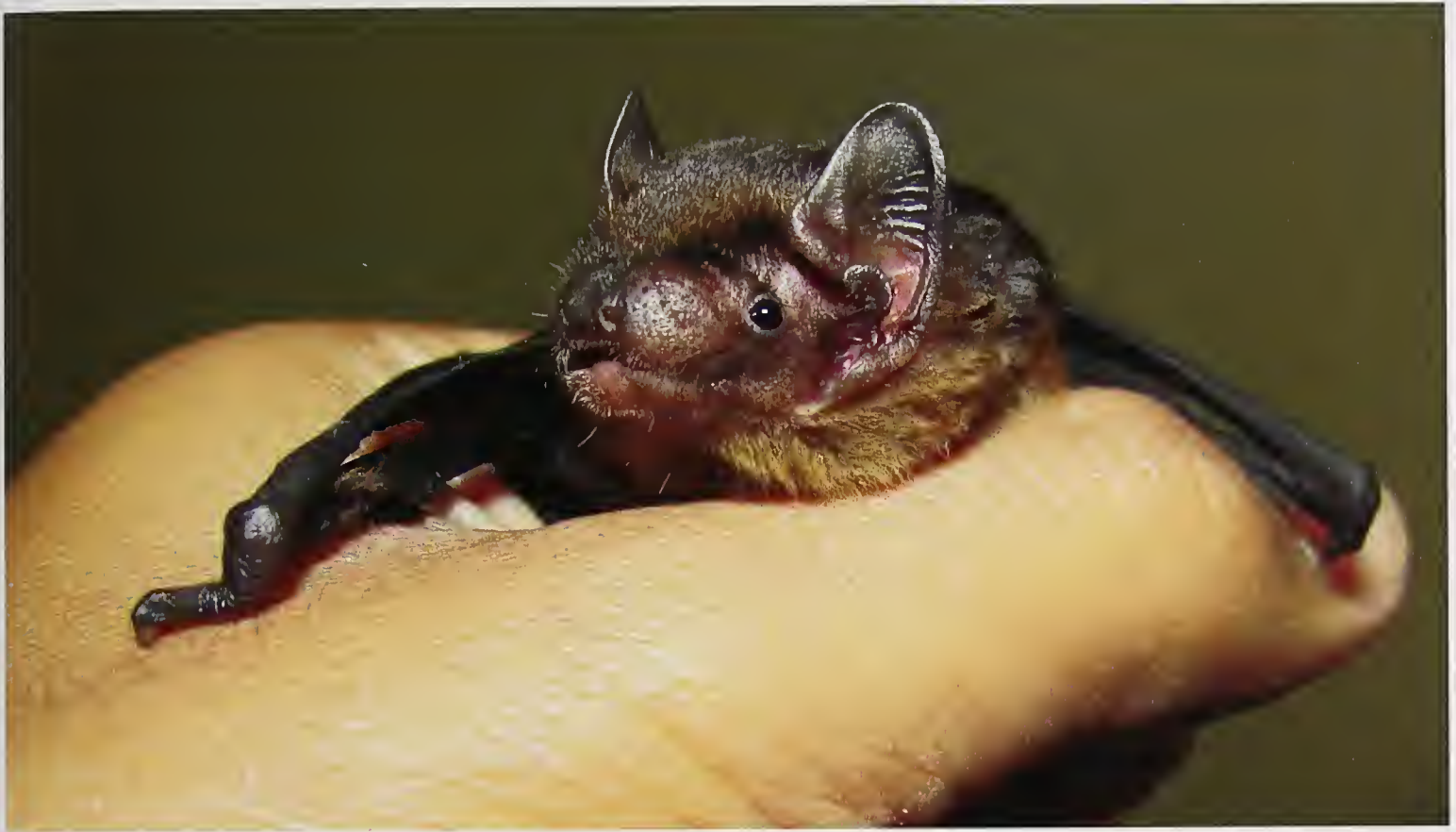
Fig. 2. Portrait of H. joffrei specimen ZSI V/M/ERS/292. Note the enlarged muzzle and short, roundish tragus.

lower canines are long and slender, and lack secondary cusps. The first lower premolar ( P_2 ) is slightly less in height than the second premolar ( P_4 ); both premolars are compressed in the toothrow. Contrary to all true Pipistrellus species, the lower molars in our specimen are myotodont which corresponds to the dental configuration found in Hypsugo (Horáček & Hanák, 1985-86).